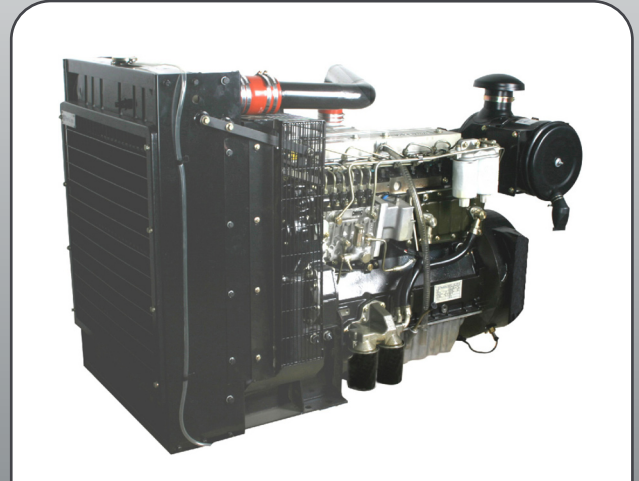
GWTA6 G BUILD ENGINE